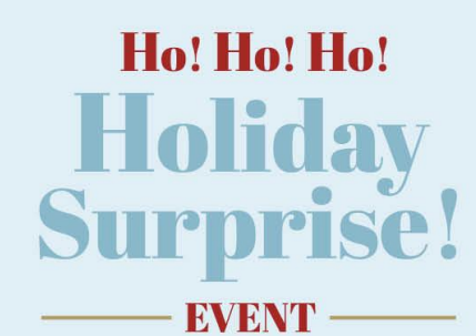
Exhibit "A" Prizes